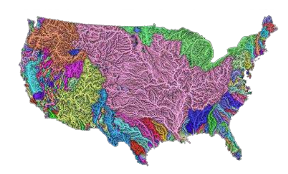
Map of river catchment areas in the United States. Pink areas indicate all watersheds that drain into the Mississippi River.

Cumulatively, the intent behind the paintings, sculpture, drawings, and prints in Breach merge into a flood of consciousness we would be well advised to heed. Although the 1927 flood may seem as if it has no bearing on today, there are striking similarities between that catastrophe, Hurricane Katrina, and the contaminated Flint River water supply. Each exposed underlying assumptions and inequalities. In this exhibition, Alison Saar asks us to consider the psychic "breach" embedded in these shared histories because when the levees of life give way, the political is most definitely personal. For everyone.