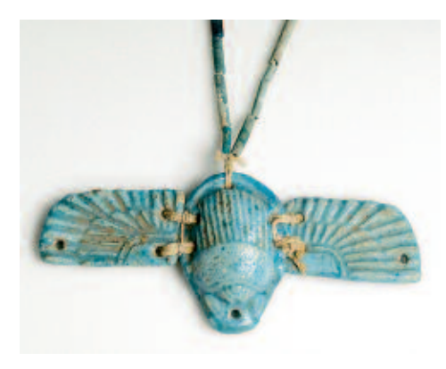
Beaded necklace with winged scarab Late Period, 712–332 B.C.E. faience, 1 x 3\frac{1}{2} x \frac{1}{2} inches The College of Wooster Art Museum 1975.546

painted or incised inscriptions that include the individual's name. Although in earlier times a range of materials was employed in their manufacture (wood, stone, metal, etc.), by the Third Intermediate Period (1070–712 B.C.E.) they were made almost exclusively in either clay or faience (glazed silicate). From this period onward, it was common for a burial to include 365 ushabtis , or one for each day of the year. The requirement led to a decline in both scale and quality; ushabtis became simple, mold-formed figures often without inscriptions. The multiple figures were commonly stored in a shrine-shaped box, such as the replica seen in the exhibition, and placed in the tomb.