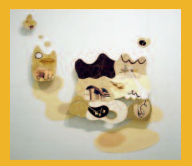
William Crow Untitled (from the Ordinary Adornment series), 2004

color-aid, watercolor, gouache wallpaper, ink, museum board dimensions variable