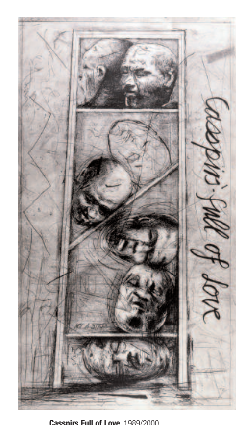
Casspirs Full of Love, 1989/2000 copper drypoint and engraving on Velin Arches Crème paper 65.75 x 37.01 inches edition of 30 Published by David Krut Fine Art, New York/Johannesburg Collection of the Artist

Perhaps one of the more disconcerting images in this exhibition can be found in the drypoint Casspirs Full of Love ,