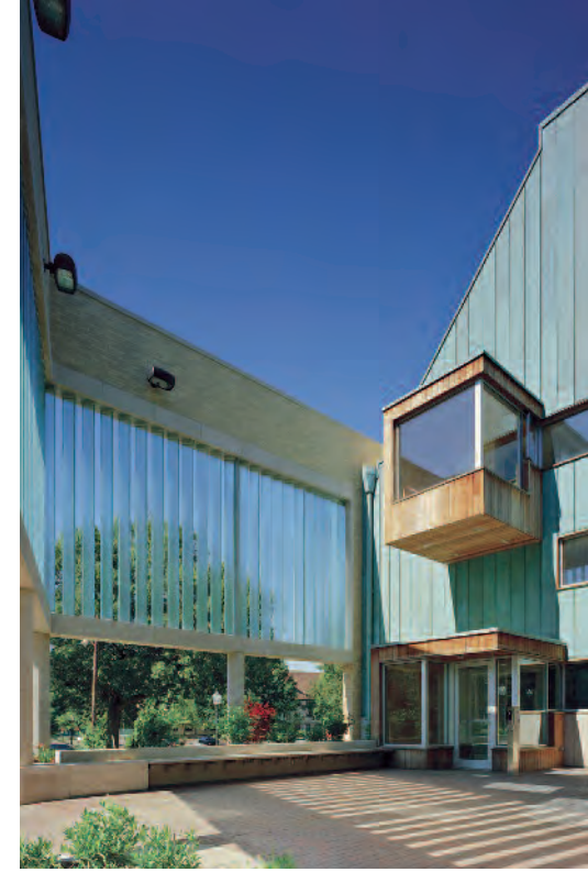
Study nook overlooking the entrance courtyard in Bornhuetter Hall, The College of Wooster, Wooster, OH, 2004.

Yet, for sheer scale and complexity, the speculative project Water Proving Ground (2010), posed perhaps the most significant physical and culturally charged design impediments to date. As part of the exhibition, Rising Currents: Projects for New York's Waterfront, organized by The Museum of Modern Art, New York, LTL was one of five architecture firms selected to research and execute a design proposal on the future impacts of rising sea levels on the New York harbor.<sup>3</sup> For their proposal, LTL was given the Liberty State Park area, which includes the Statue of Liberty and Ellis Island. Instead of designing sea walls or increasing the height of the existing landfill, their design solution reshaped the existing landfill into a series of gradual slopes that would engage both the fluctuations in tide and higher sea levels through aquaculture, parks, a water hotel, and a produce market, to become an amphibious landscape activated by rising tides and connected by both land and water transportation.4 An economically desirable aspect of their design is the considerably increased coastline within a highly populated urban area.