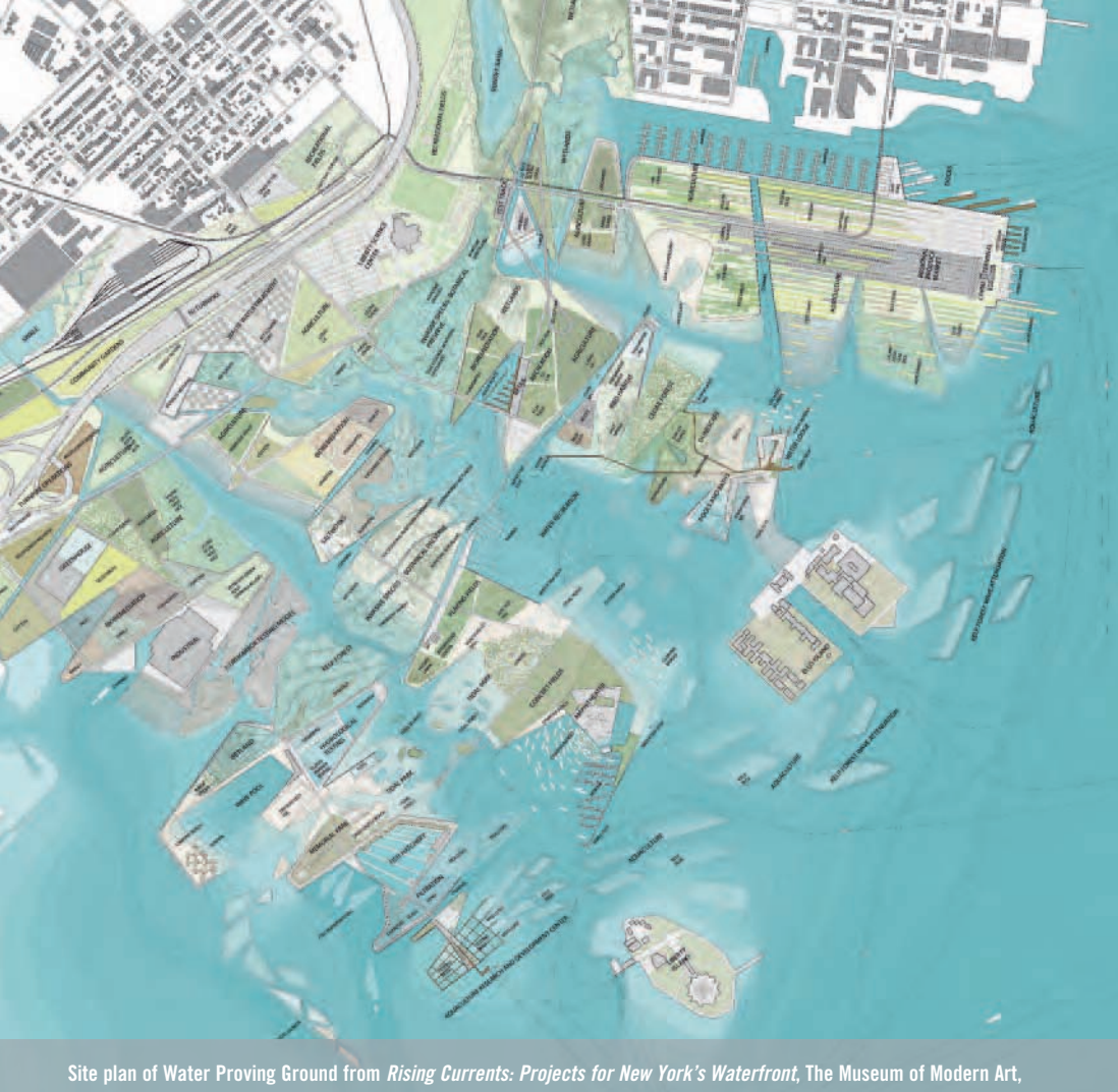
Site plan of Water Proving Ground from Rising Currents: Projects for New York's Waterfront , The Museum of Modern Art, New York, NY, March 24–October 11, 2010. Drawing: LTL Architects