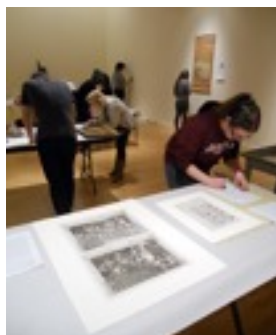
Museum Studies Peer Editing Workshop. Burton D. Morgan Gallery, February 23, 2012.