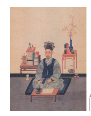
19세기 비단에 채색 55.8×34.9cm 일암관