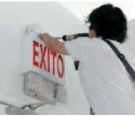
Exito (sign), 2007 Exit sign with lamps Edition of 5

Front (detail) and overleaf: Just give me a place to stand , 2007 dimensions variable Installation view from the exhibition Host , 2007, Soap Factory, Minneapolis, MN Lumber, dolly, gallon water jugs, cinder blocks, fluorescent light bulbs, fish tank, vase, water, air pump, sofa, lamp, dollies, milk crate, fused light bulbs, mirrors, concrete, tables, bricks, tabletop, cushion, plate, magazines, desk, plant