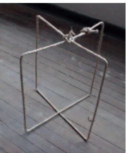
If you say something, see something, 2010 rope, resin dimensions variable