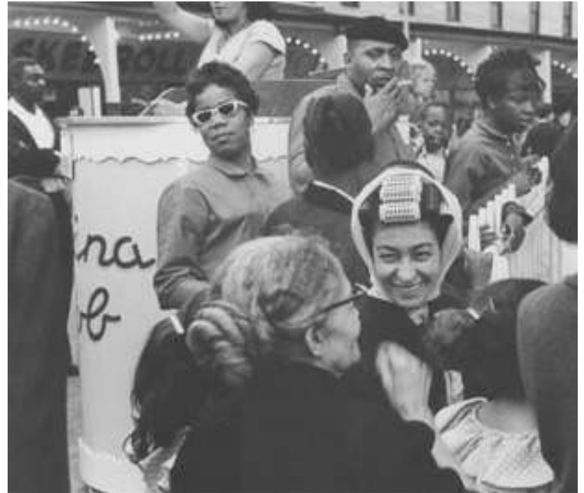
Builder Levy (American, b. 1937) Sunglasses and Curlers, Coney Island, New York, 1963