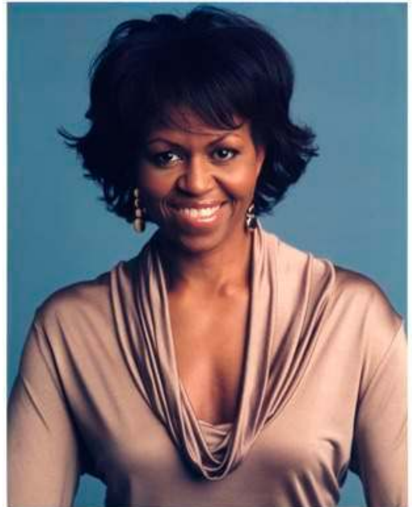
Timothy Greenfield-Sanders (American, b. 1952)