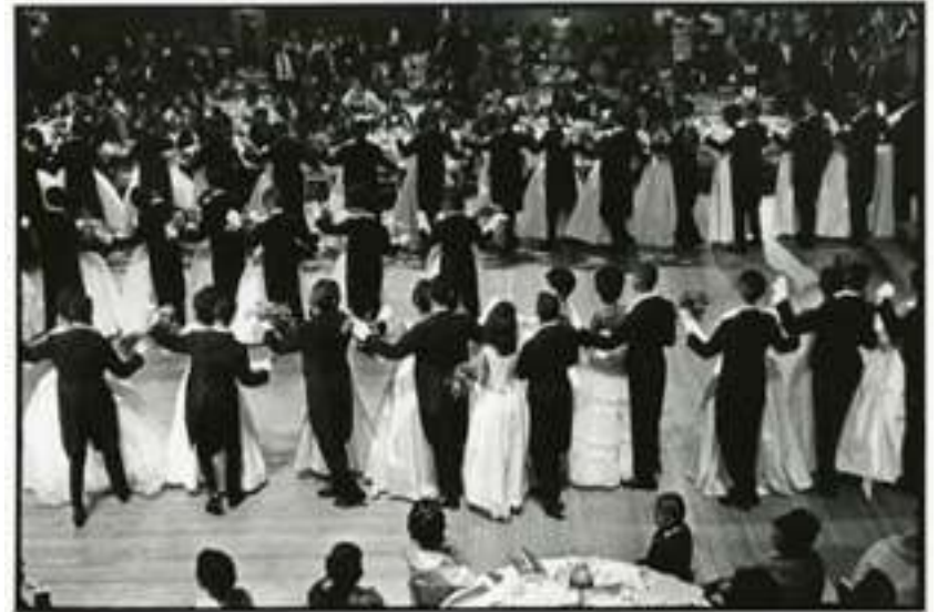
Eve Arnold (American, 1912–2012) Black Debutante Ball, Waldorf Hotel, New York, 1964

This photograph taken by Arnold depicts a black debutante ball in New York City at the Waldorf Hotel. Although a common practice among elite white families, the black elite adopted this tradition as well, and it has continued to the present-day as a rite of passage for many African American girls. This particular photograph, taken from behind the couples lined up in two rows and in black and white, makes it difficult to identify the ethnicities of the young men and women at first glance. This debutante ball was held to raise funds for the black cause during the civil rights movement. During the same year as the ball, the Civil Rights Act of 1964 was passed which made discrimination in hiring, based on sex and race, illegal.