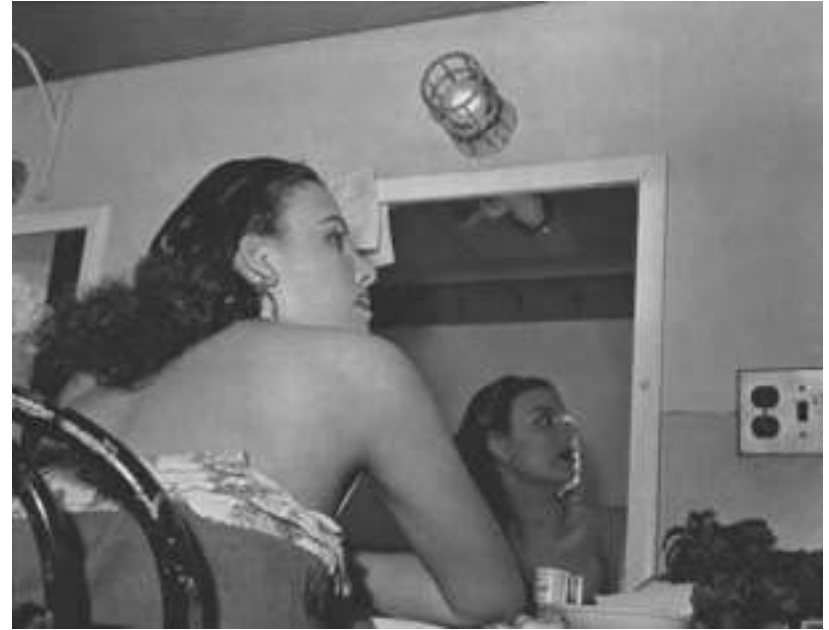
Charles "Teenie" Harris (American, 1908–1998)