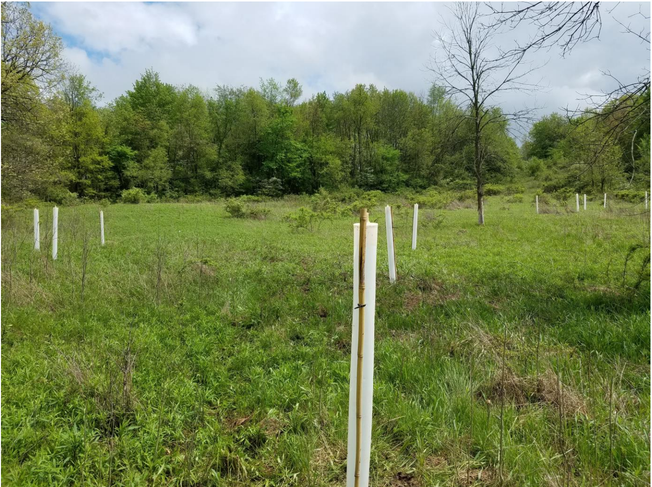
The old cattle pasture in May 2020.

In April 2020, with the help of two I.S. students (Caden Croft, '21 and Oria Daugherty, '21), I started planting seedling trees in the north meadow at Fern Valley. If you haven't ever been to the north side of the property, you can park along Township road 511 and enter this area via a footpath (there is a sign but no parking lot). The rest of Fern Valley is mature deciduous forest but this 8-acre meadow is a goldenrod field that used to be cattle pasture until approximately 2013. Of course, the meadow was forested before European settlement, and this project aims to re-forest it to create additional wildlife habitat and provide an opportunity for our students to study this ecological transition. And the carbon sequestration doesn't hurt either! To date, we have planted or protected over 200 young native trees in the meadow. Some of these are now tall enough to be peaking out of the tops of the tree tubes! The tree tubes are absolutely necessary to protect the young seedlings from hungry deer but eventually will be removed.