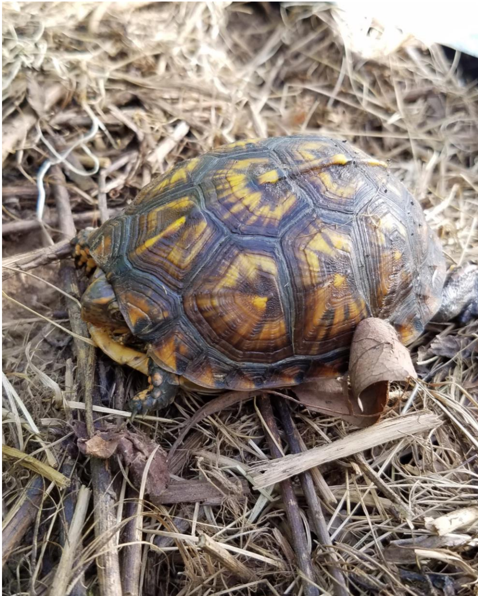
Box turtle found at Fern Valley, June 16, 2022.