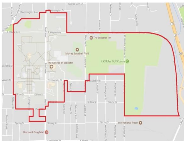
Map of the immediate campus boundaries