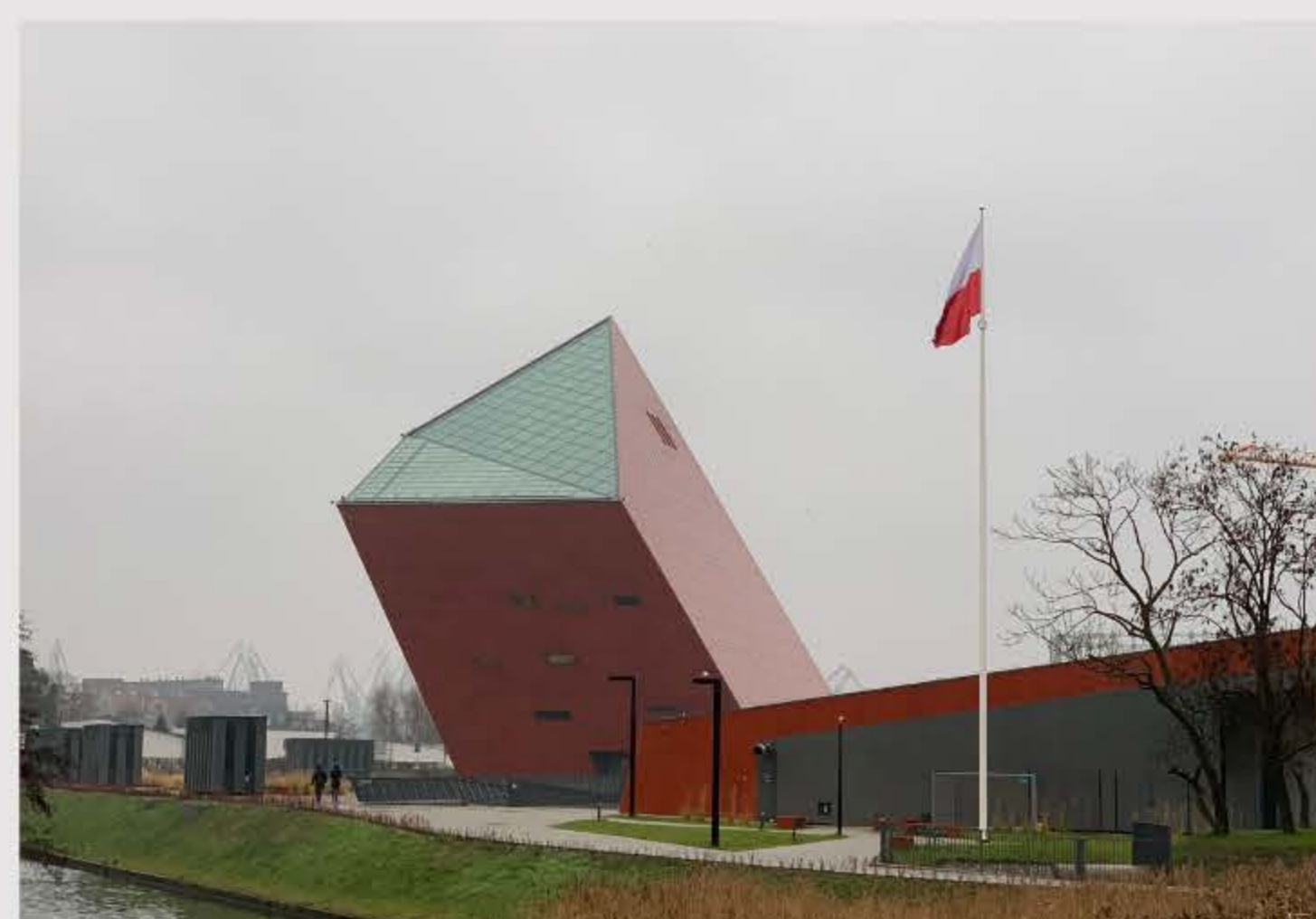
Exterior Museum of the Second World War Gdańsk, Poland, 2019

Politics have the power to shape memory, determining the stories that are told and the ones that are suppressed. Poland's memory struggle is not over and remains, even today, a site of political contestation.