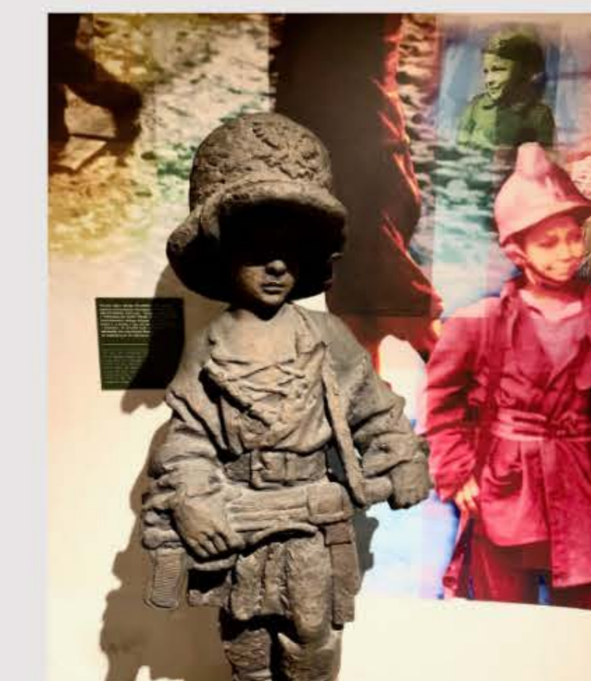
Child Soldier Warsaw Rising Museum Warsaw, Poland, 2019