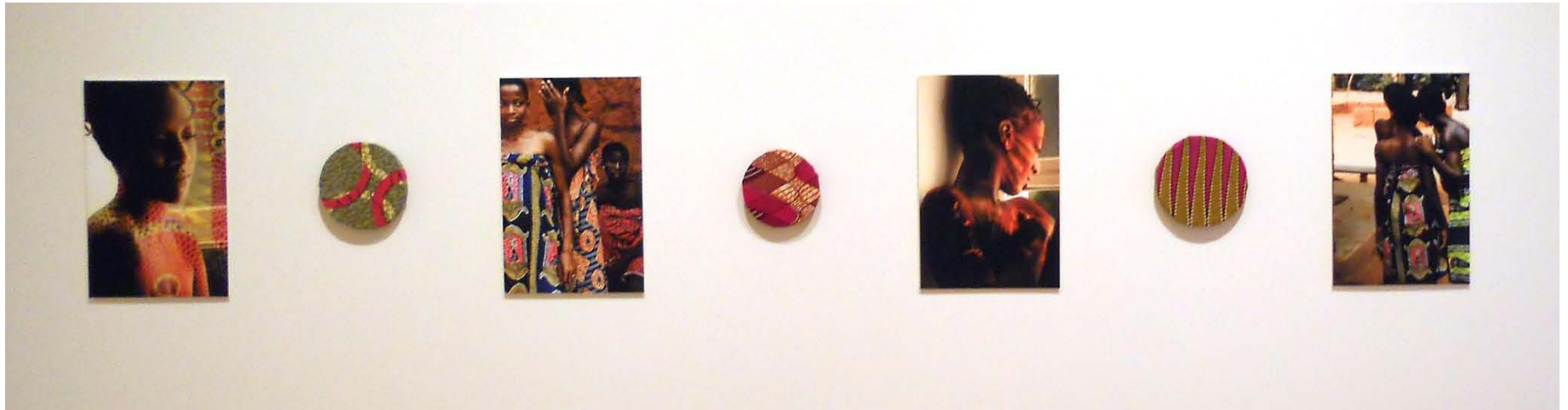
Photo Fabricated Memory: An Autoethnographic Study of the Female Preception of Beauty, Through the Photography by the Nzulezu and Akaa Women