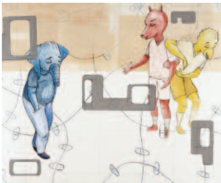
Kojo Griffin Untitled, 2003 monotype, chine collé 30 x 38 inches

What is happening in the print above by Kojo Griffin? Are these animals or humans? Are they friends?