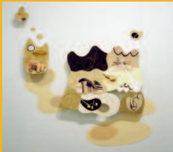
William Crow Untitled (from the Ordinary Adornment series), 2004 color-aid, watercolor, gouache, wallpaper, ink, museum board dimensions variable