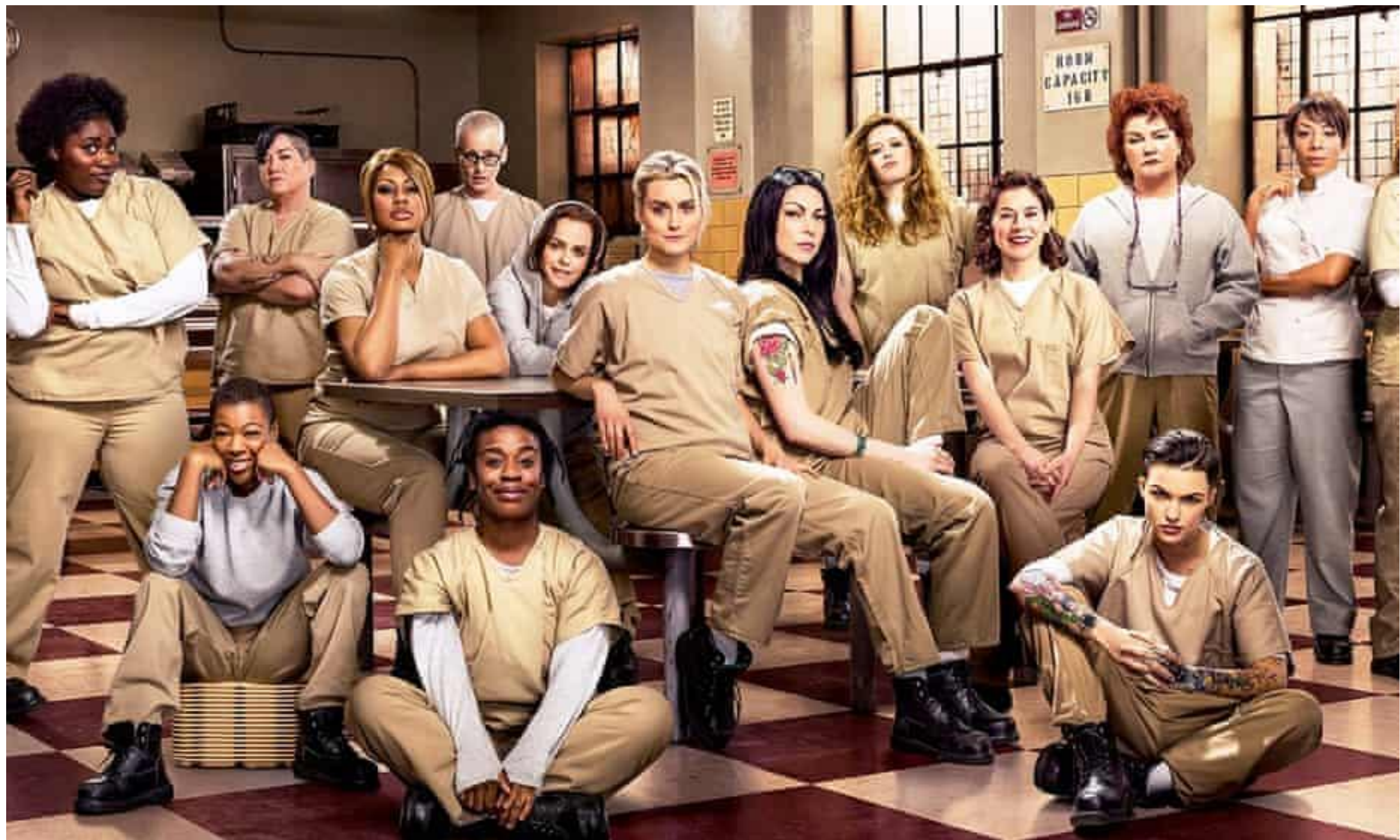
Moylan, B. (2016, June 15). Orange is the new black: Season four will take over your life, without parole . The Guardian. Retrieved April 7, 2022, from https://www.theguardian.com/tv-and-radio/2016/jun/15/orange-is-the-new-black-season-four-review