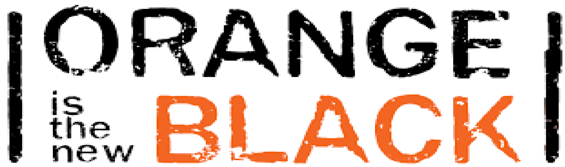
Moylan, B. (2016, June 15). Orange is the new black: Season four will take over your life, without parole . The Guardian. Retrieved April 7, 2022, from https://www.theguardian.com/tv-and-radio/2016/jun/15/orange-is-the-new-black-season-four-review