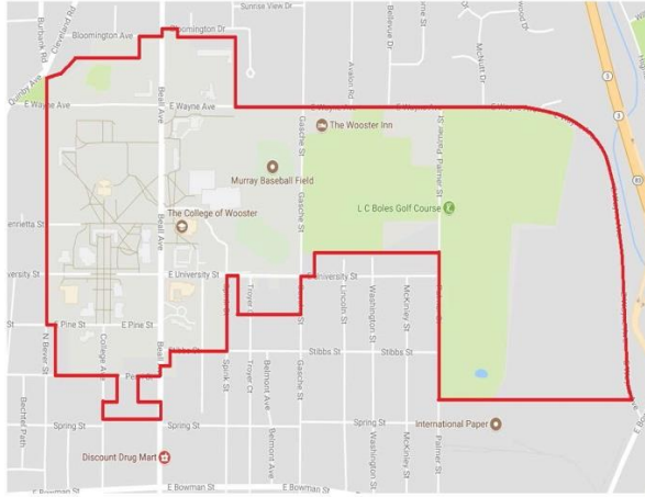
Map of the immediate campus boundaries