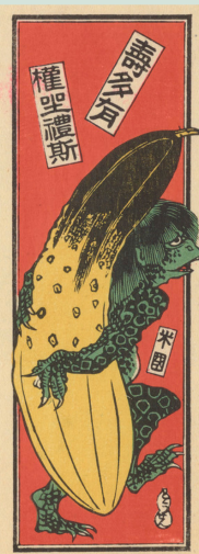
Nōsatsu of kappa and cucumber (late Edo period)