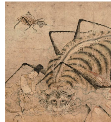
Tsuchigumo sōshi picture scroll (1185-1333)