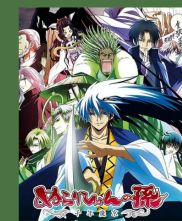
Nura: Rise of the Yokai Clan (2010)