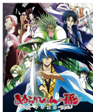
Nura: Rise of the Yokai Clan (2010)