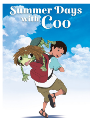
Summer Days with Coo (2007)

This section covers trends and observations from my content analysis of three media pieces from three different decades of the modern period that feature kappa characters in speaking roles.