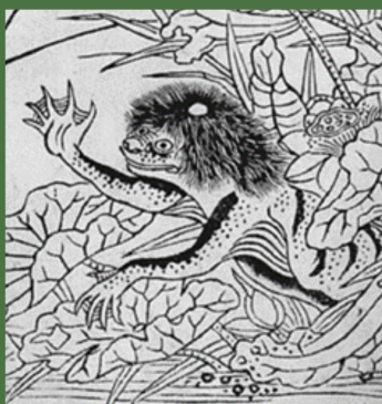
Kappa from Gazu hyakkiyagyo by Toriyama Sekin