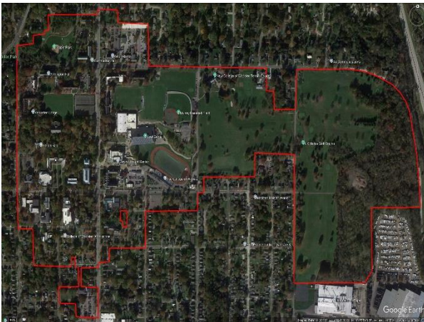
Map of the immediate campus boundaries