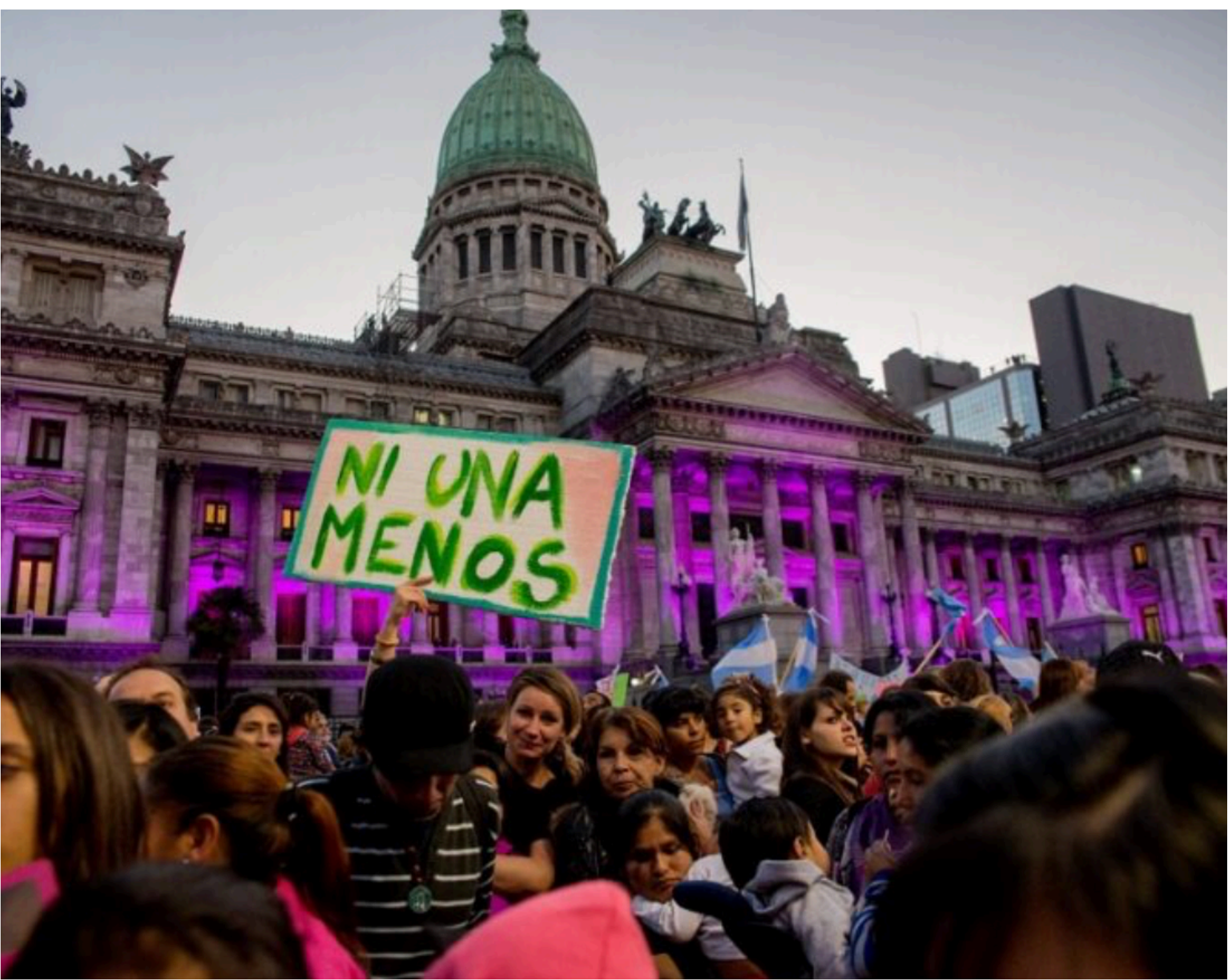
Ni Una Menos (2015)

What is the role of cinematic works in the representation of women’s access to abortion and the issues faced by the LGBTQ community while fostering social awareness and legal changes?