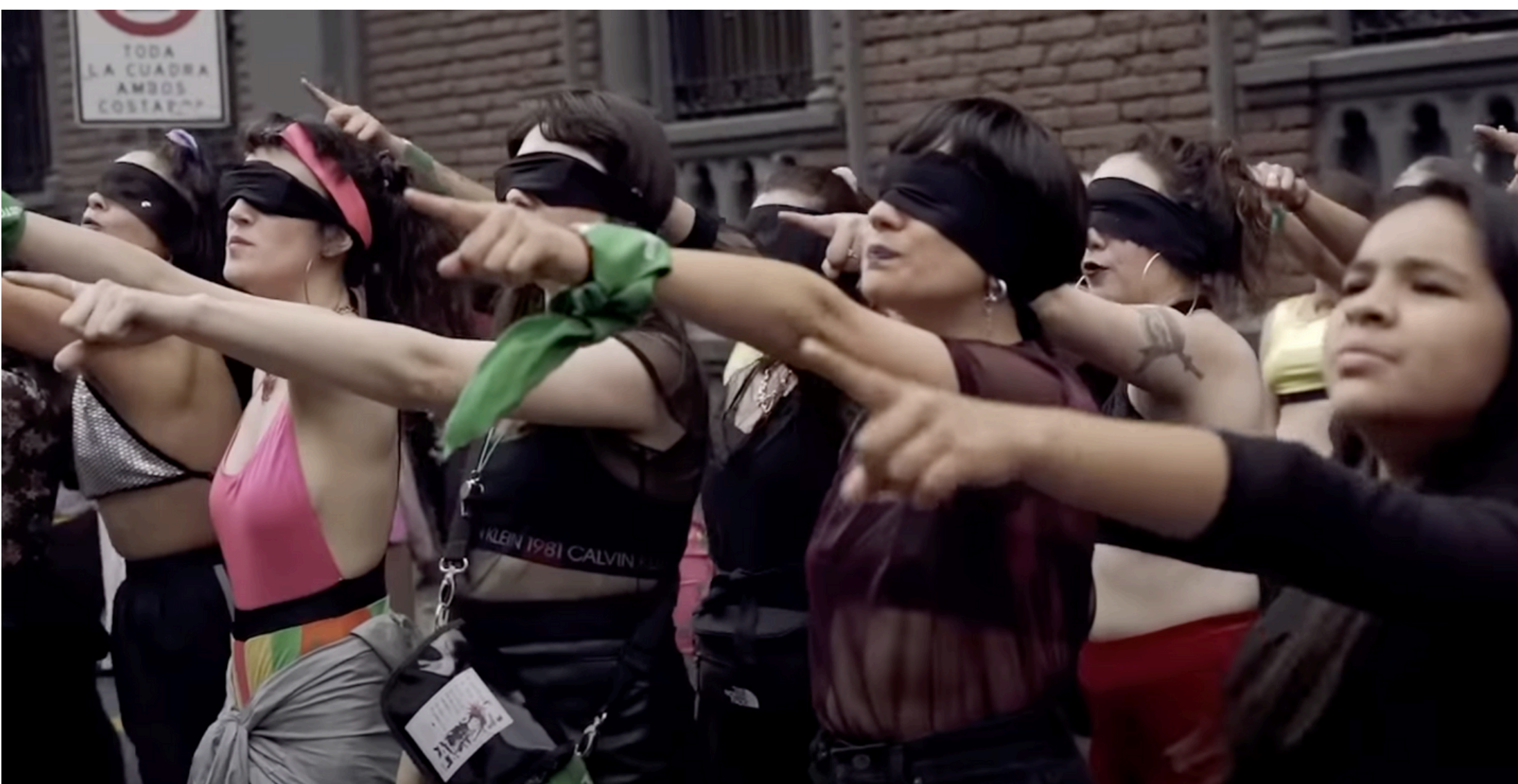
Un Violador en Tu Camino (2019)