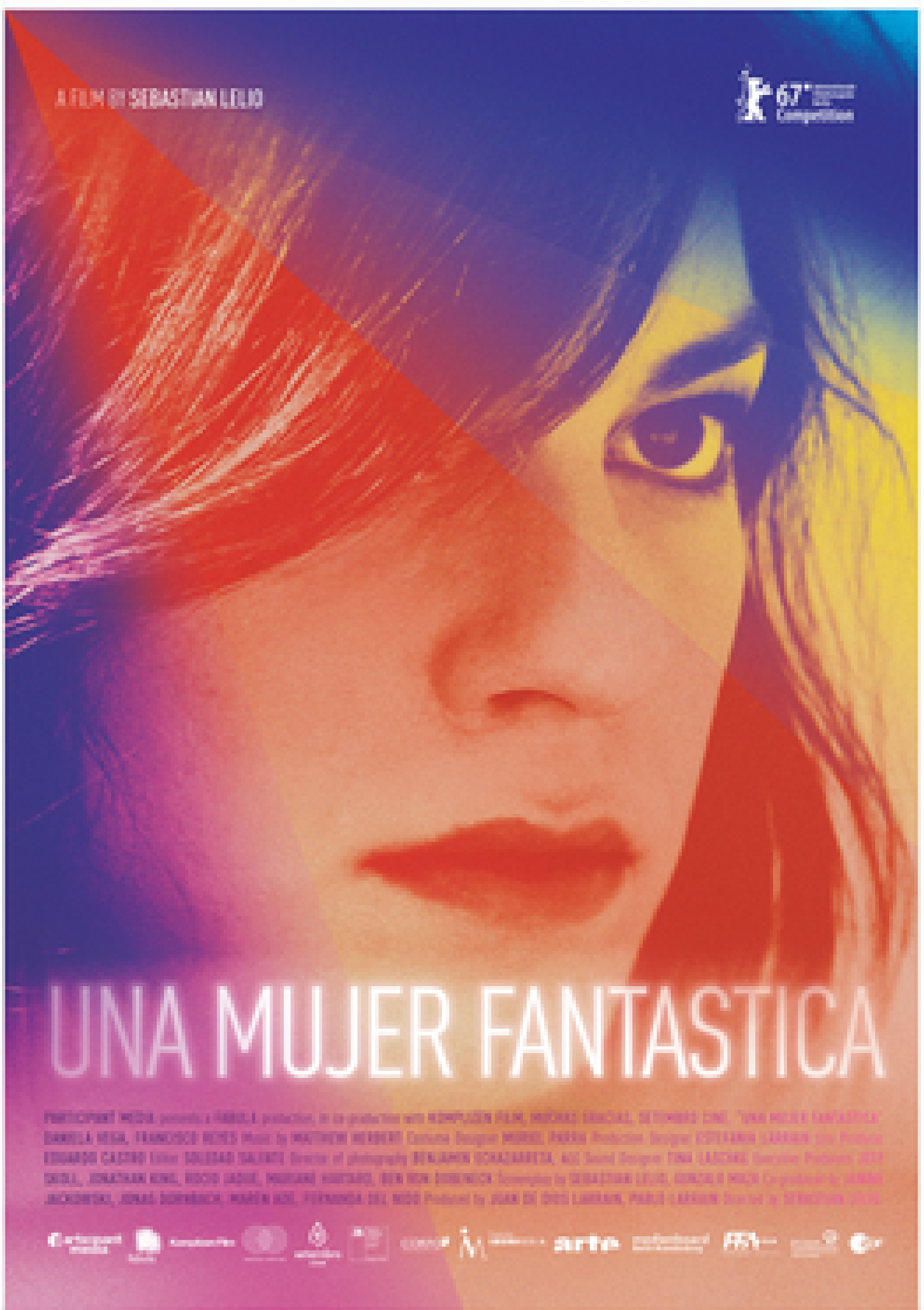
Una mujer fantástica (2017)