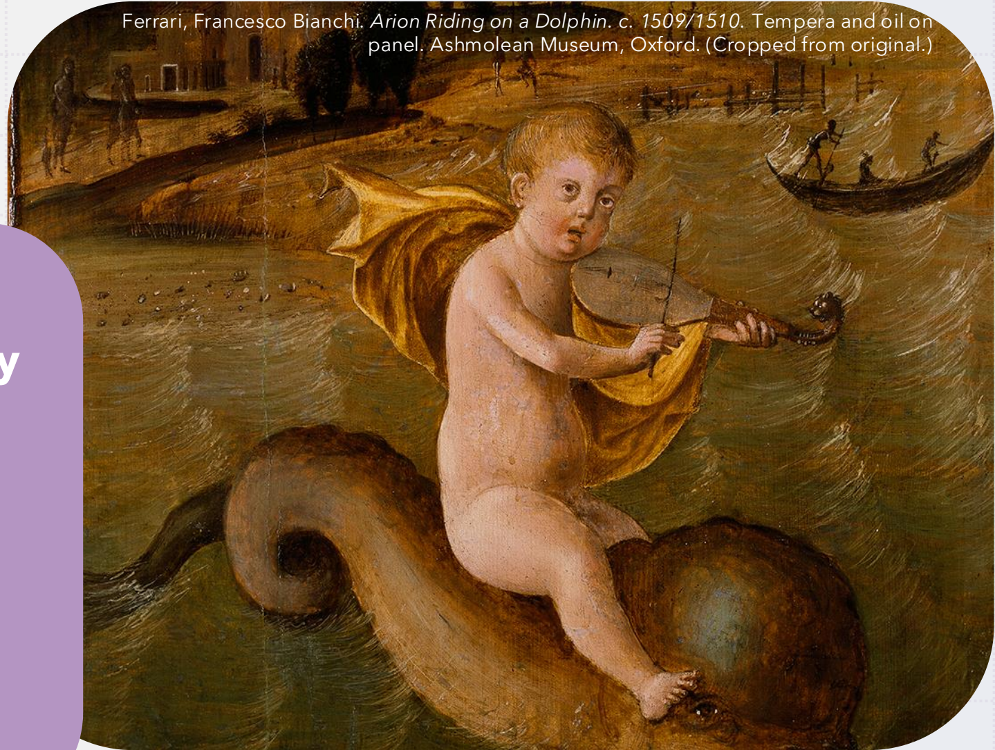
Ferrari, Francesco Bianchi. Arion Riding on a Dolphin . c. 1509/1510. Tempera and oil on panel. Ashmolean Museum, Oxford. (Cropped from original.)