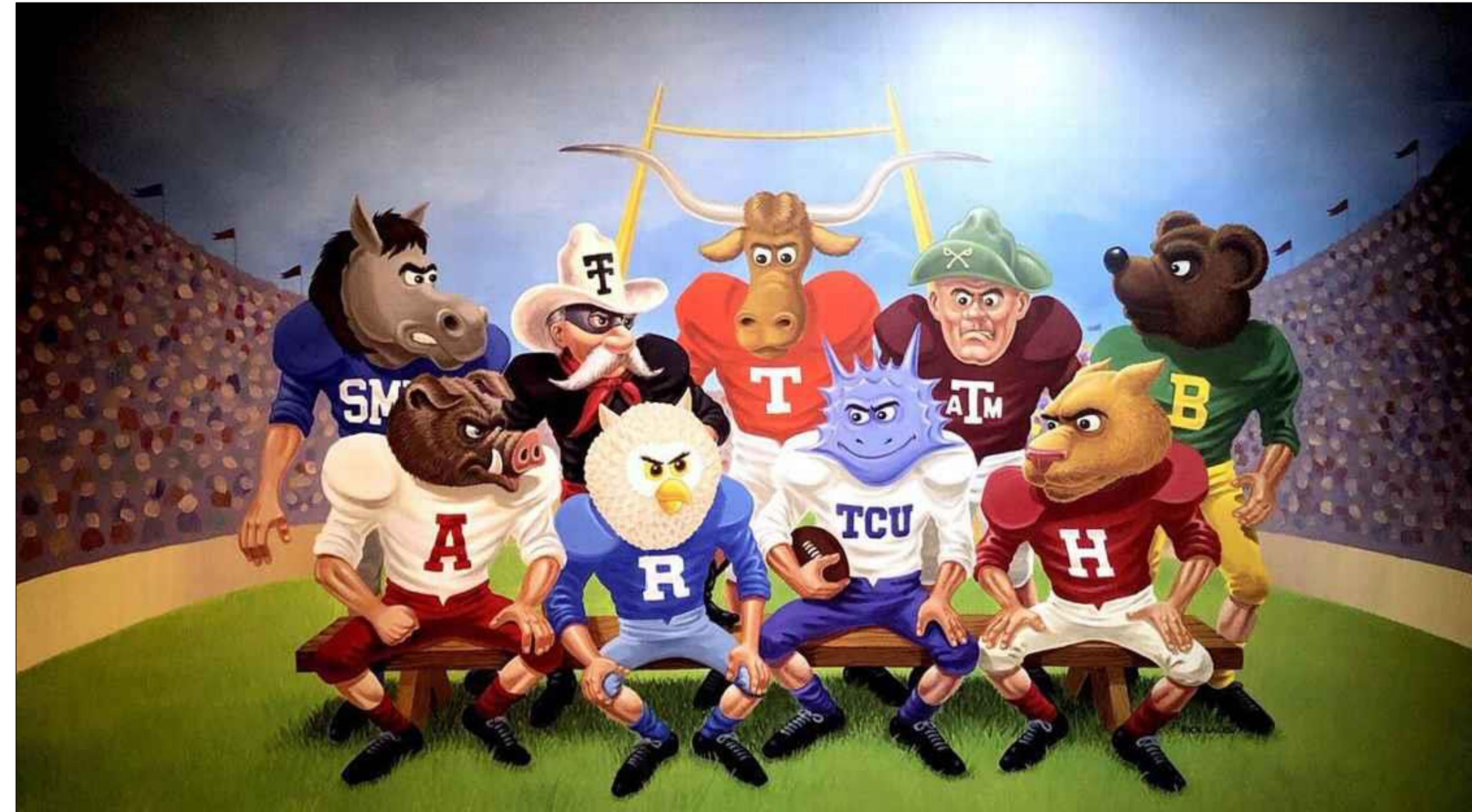
Above: Family Portrait of the SWC , showcasing the mascots of the nine universities