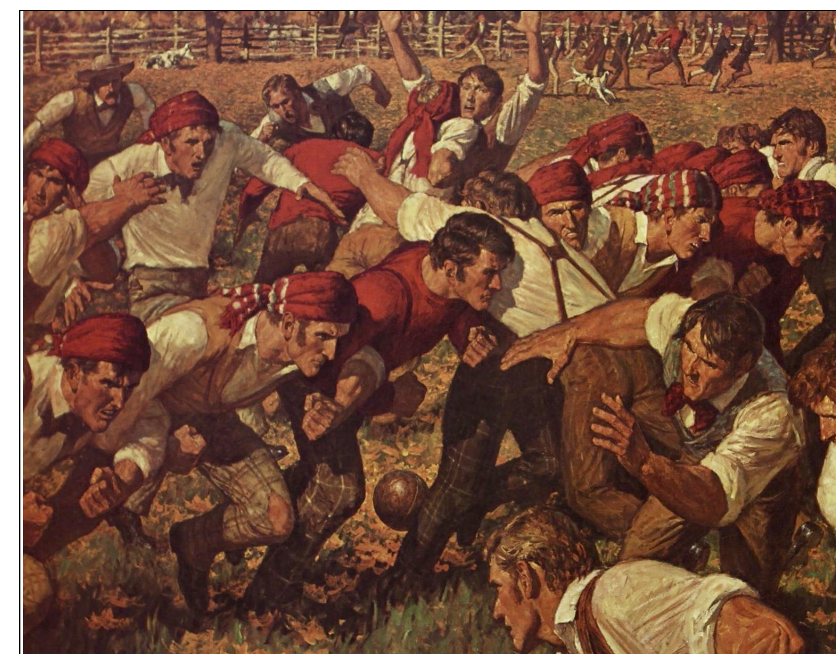
Above: The First Game