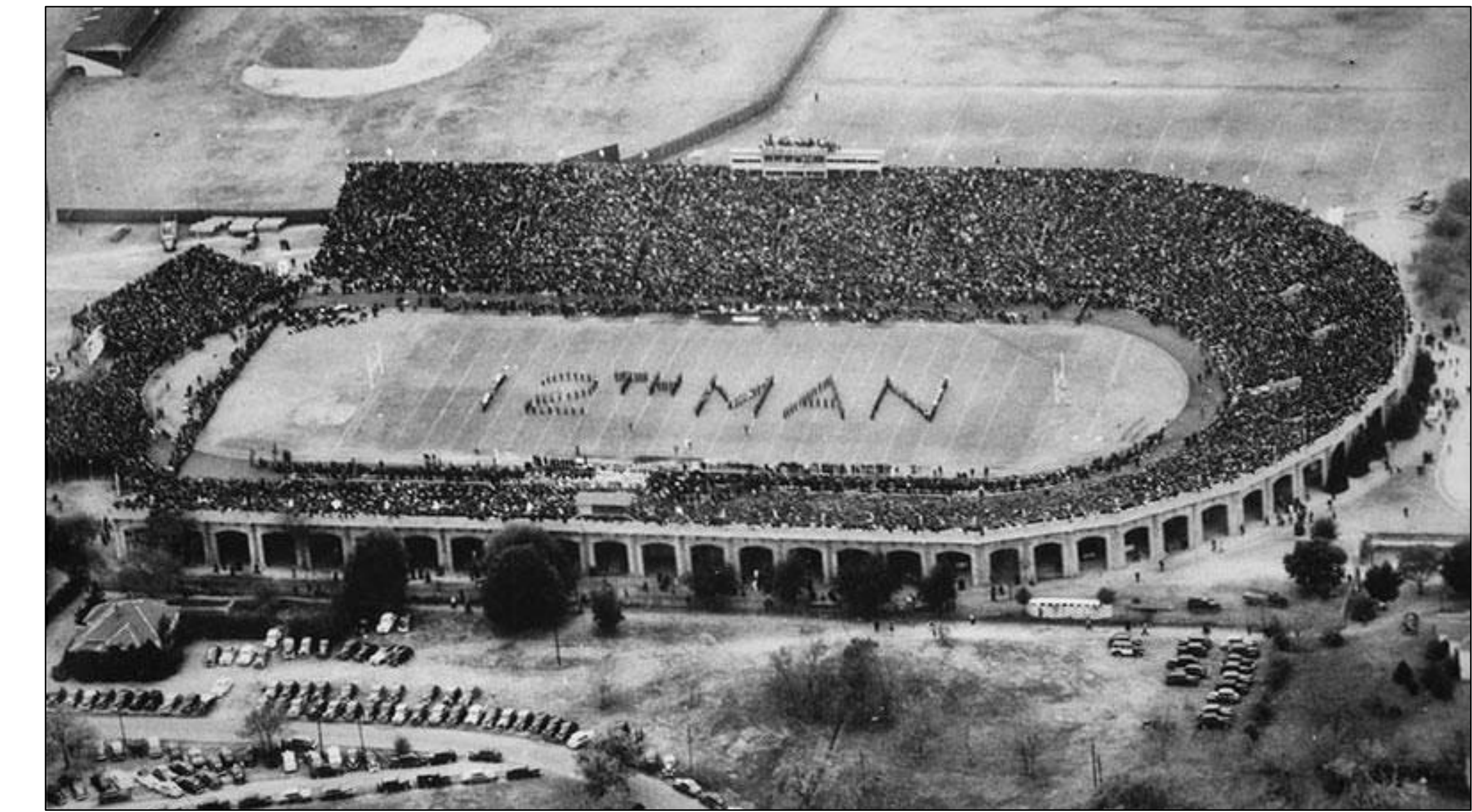
Above: Kyle Field following its 1930 booster-funded expansion.